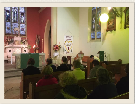
Holy Hour at Immaculate Conception, Tumut

October 13 - Sacred Heart, Cootamundra (12pm) November 28 - Sacred Heart, Pearce, ACT (6.30pm) December 3 - Our Lady, Star of the Sea, Narooma (9.30am) December 10 - St Patrick's, Cooma (10am)