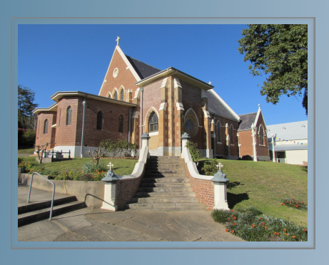
St Patrick's Gundagai