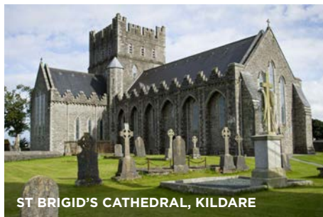
ST BRIGID'S CATHEDRAL, KILDARE