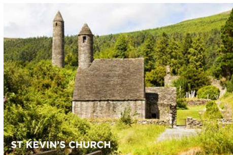
ST KEVIN'S CHURCH