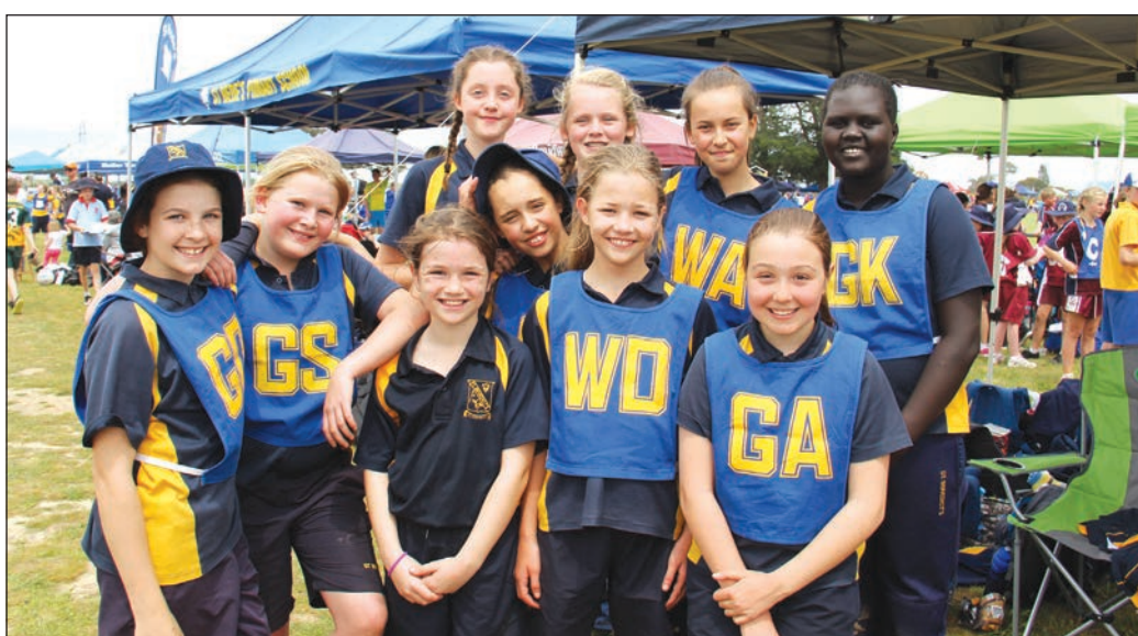
Students from St Benedict's Primary Narrabundah had an enjoyable day.

He gave special mention to Boorowa Central High School, Hennessy Catholic College Young, Trinity Goulburn, John Paul College Nicholls and Merici College Braddon for taking on many extra responsibilities throughout the carnival.