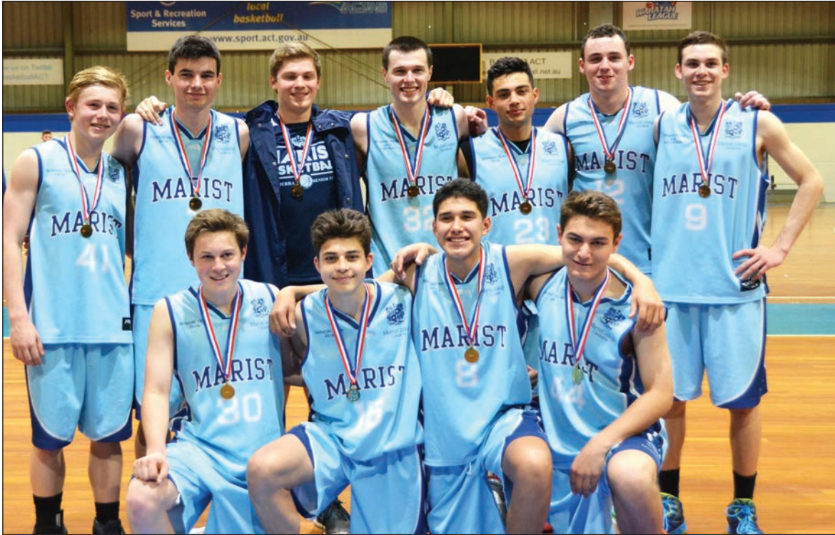
MCC Senior Team Back to Back U19 Division 1 ACT Championship Season.

The team ended the season with 12 wins and four losses in a year