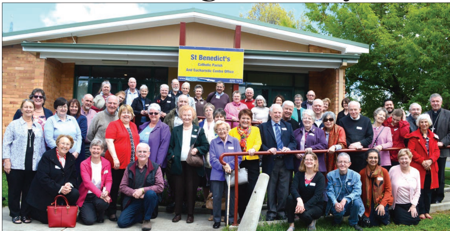
Members of the Cursillo Movement assemble for the spirituality weekend in late October.

For Pope Francis, this Gospel message is simply: "Jesus Christ loves you; he gave his life to save you; and now he is living at your side every day to enlighten, strengthen