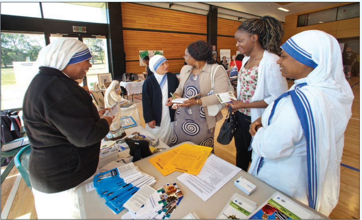
The Missionaries of Charity Sisters and some parishioners check out the stalls at the Queanbeyan Parish Expo.