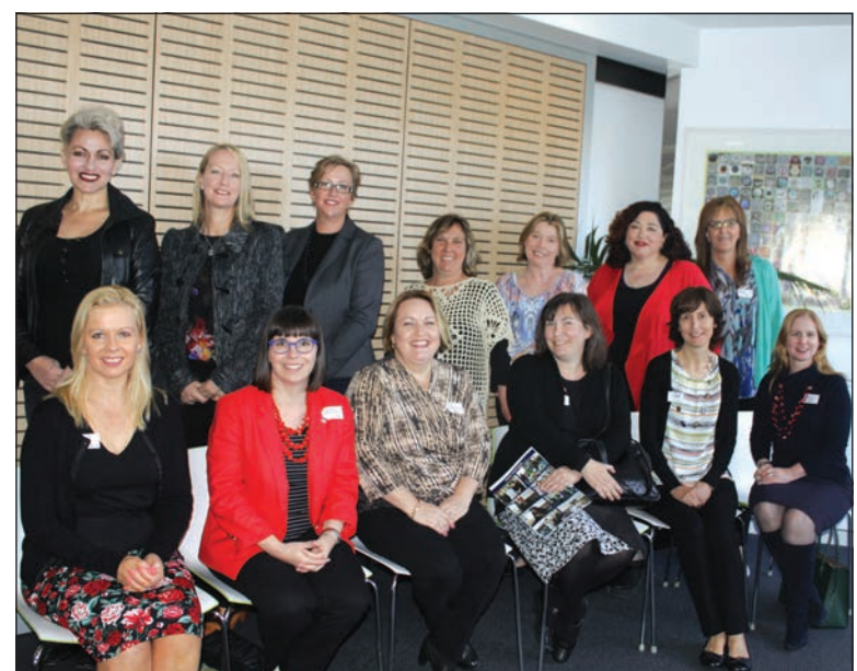
The class of 1986 returned to Merici College for a reunion and tour of the school.

Merici College welcomes updates on ex-students and encourages past students to get in contact with the school by emailing alumni@merici.act.edu.au