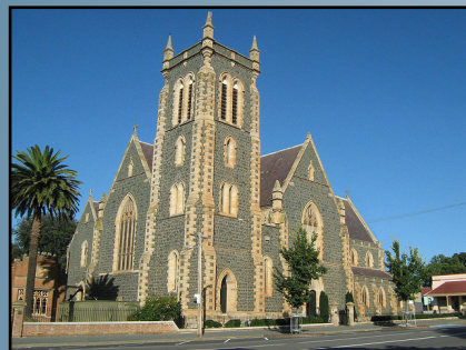
St Peter and Paul's Cathedral, Goulburn

Let the little children come to me (Mt:19.14)