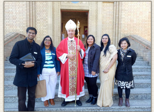
Archbishop Christopher with our Cathedral Catechists

Latest Catholic news from around the world