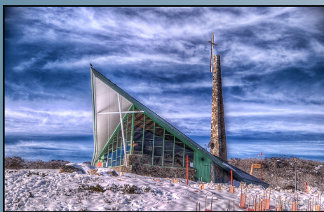
Our Lady of the Snows, Perisher Valley