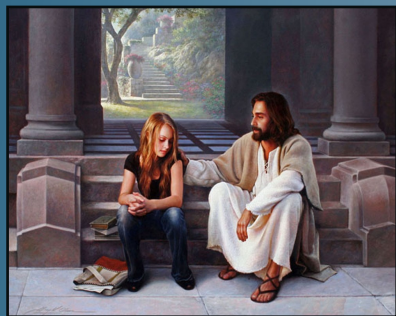
Let the little children come to me (Mtt:19.14)