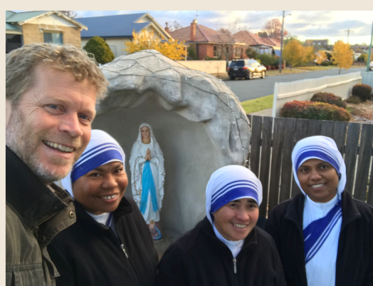
Me with the Missionary of Charity Sisters at Queanbeyan

Latest Catholic news from around the world