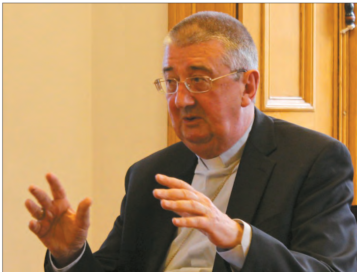
Archbishop of Dublin Diarmuid Martin says the Church in Ireland needs a 'reality check' after the country voted to legalise same-sex marriage on May 22. Only 38 per cent of voters opposed the legislation.

In an interview following the news that the referendum