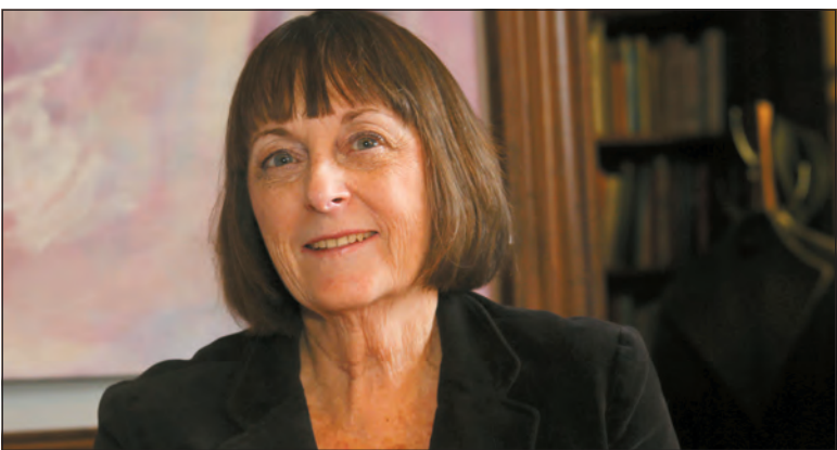
Professor Margaret Somerville is a renowned bioethicist.