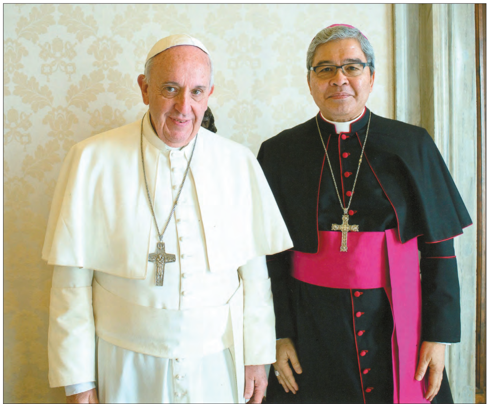
Archbishop Adolfo Yllana with Pope Francis in April, shortly before the Archbishop left for Australia to take up the role of Papal Nuncio. The 68-year-old Filipino cleric has served in the diplomatic role for more than 30 years.

His initial priestly roles were filled in seminaries in the Philippines, before he went to