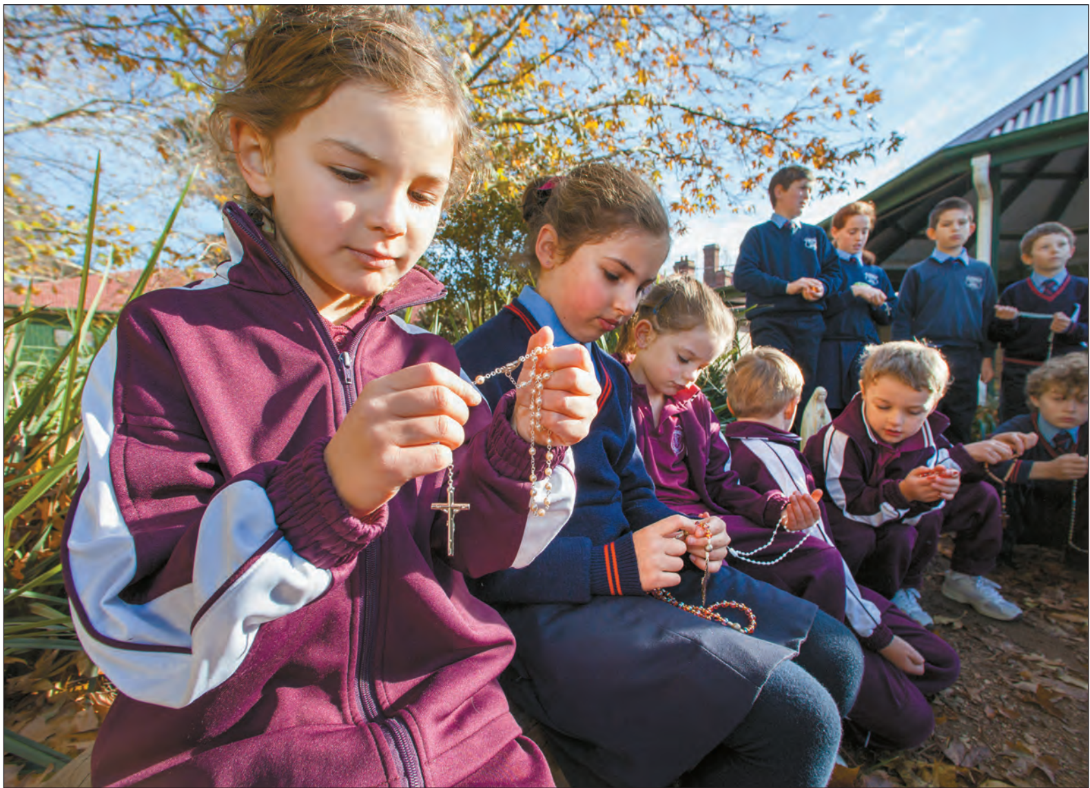
St Bede's Catholic Primary School students from Kindergarten through to Year 6 prayed a decade of the Rosary together almost every day during May.

"The children really do enjoy it, even if they forget their Rosary beads, many are still attending, which is lovely. They just enjoy praying together. They're very positive and enthusiastic about it."