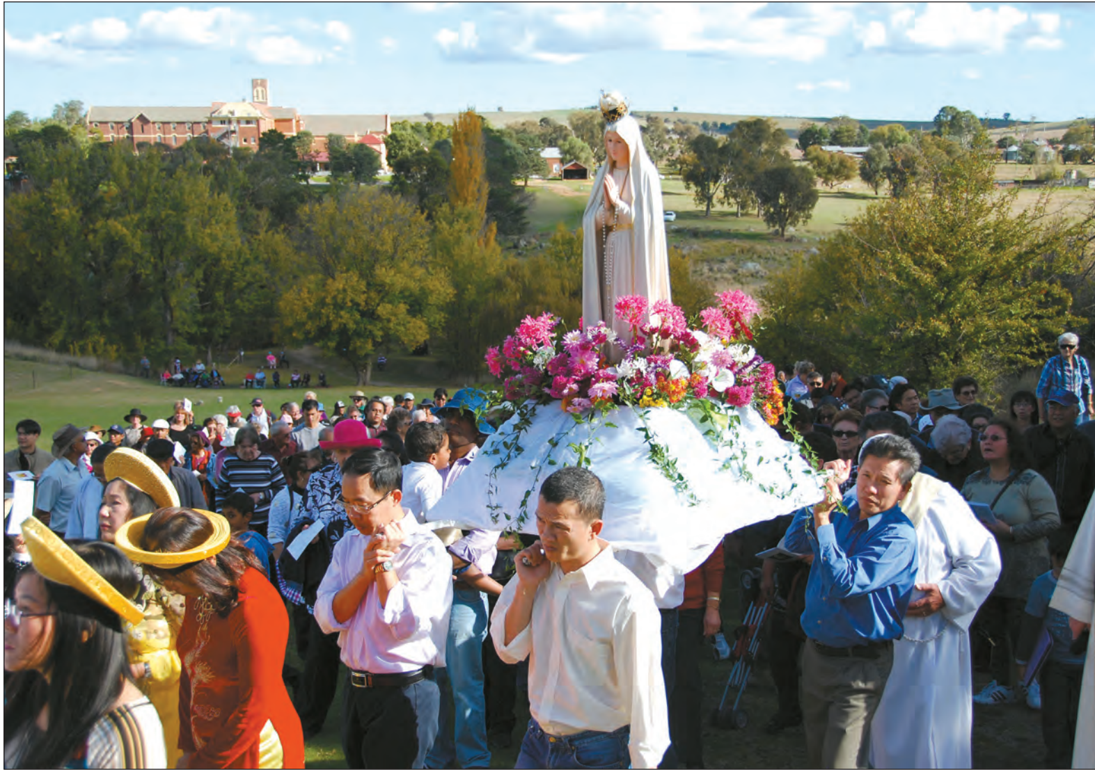
A strong crowd took part in the annual Marian procession at Galong last month, including representatives of various ethnic communities.

"Pope St John Paul II described the family as the 'sanctuary of life and love', and surely it is, as we witness it here today.