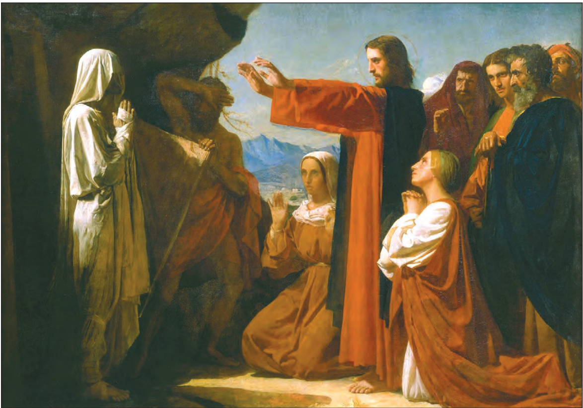
Jesus' raising of Lazarus from the dead showed how the resurrection applies to our lives right now.

Fear is replaced by joy and determination. The resurrection of Jesus is the physical and spiritual manifestation of a divine reality: that God is not at all constrained by the limitations of creation. In Jesus Christ we see the foundation of our own hope: that in him, suffering and death are not the last word. In fact, they are not even particularly significant words. They are nothing to God. So, how's your resurrected life going? It must be admitted that many of us tend not to think of the resurrection as applying to our lives here and now. Perhaps we hold on to it as a hoped for future possibility... and miss out on its impact on our lives today. Take a look at the conversation between Jesus and Martha on the subject (John 11). It centres around this very point. Martha assumes that the resurrection is something that will only make an impact in the future: "I know my brother will rise again on the last day". To this, Jesus counters in two ways. First, he proclaims: "I am the resurrection and the life", and then he raises Lazarus from the