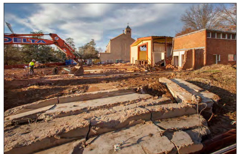
Demolition work will continue on the Manuka precinct site until the end of June, weather permitting.