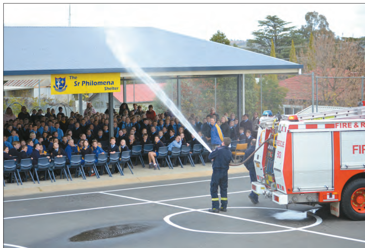
The Young Fire Brigade douse the new Sr Philomena Shelter at St Mary's Primary School.

The multi-purpose shelter was built as a result of the fundraising efforts of the