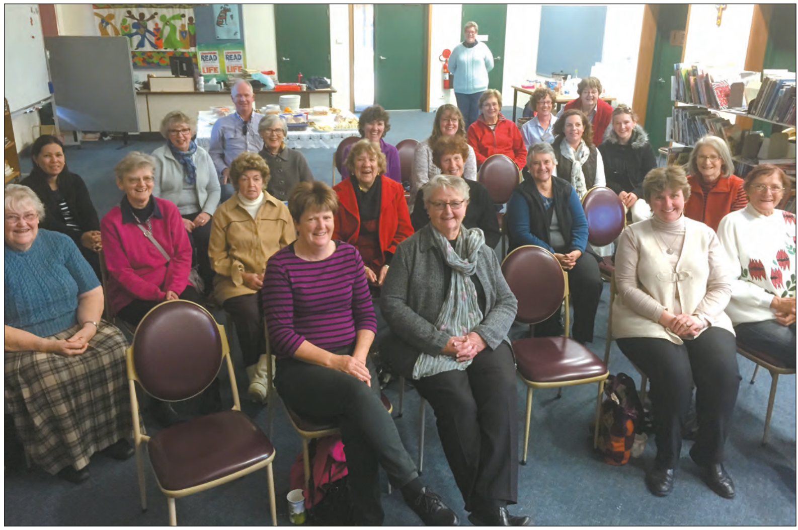
Some of the catechists from the Western Deanery of the Archdiocese during a recent training day.

The above quote came from Pope Francis' message at the International Day of Catechists in Rome. This was attended by more than 2,000 catechists from all over the globe and was held in the Paul VI Hall in the Vatican. There were many excellent messages, with an emphasis