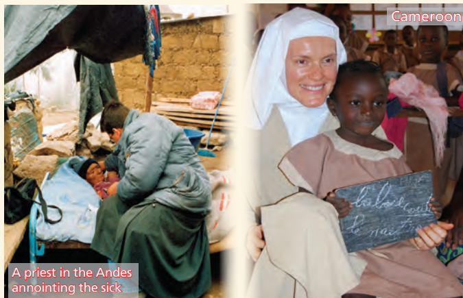
A priest in the Andes anointing the sick

A beautiful 'Year of Consecrated Life' rosary designed by the Vatican rosary makers and blessed by Pope Francis, will be sent out to all those who donate to this cause and tick the box below.