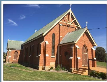
St Joseph's Delegate, NSW.