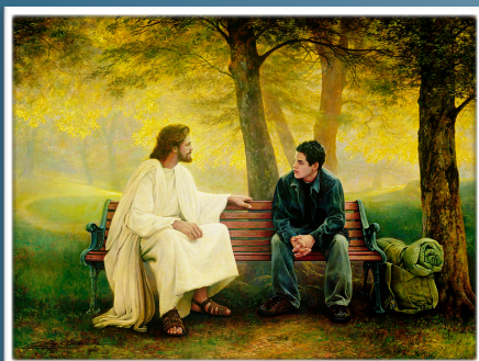
'Let the little children come to me' Jesus