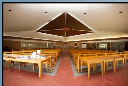
St John the Evangelist Chapel, ANU