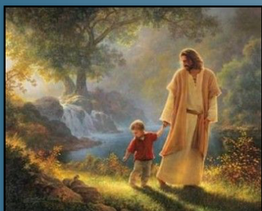
Let the little children come to me (Jesus)